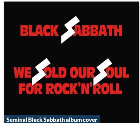
Seminal Black Sabbath album cover

Mr Justice Dingemans refused the Defendants' application for permission to appeal, which is now with the Court of Appeal.