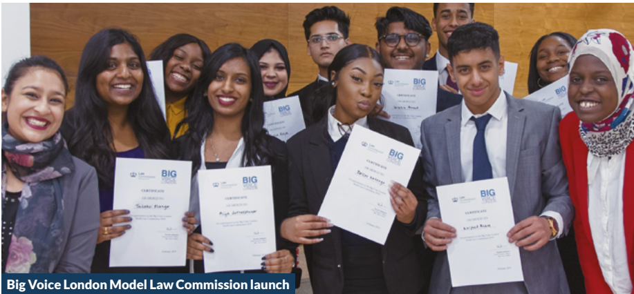
Big Voice London Model Law Commission launch