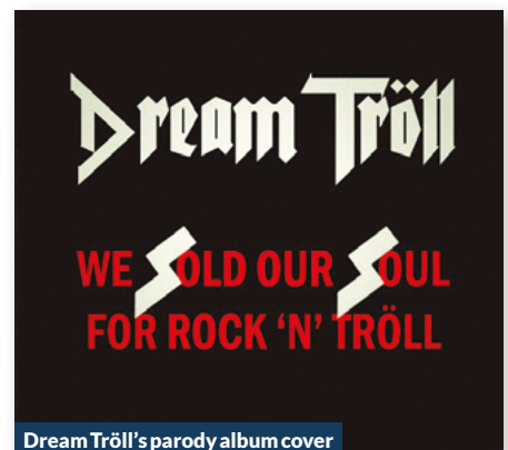
Dream Tröll's parody album cover